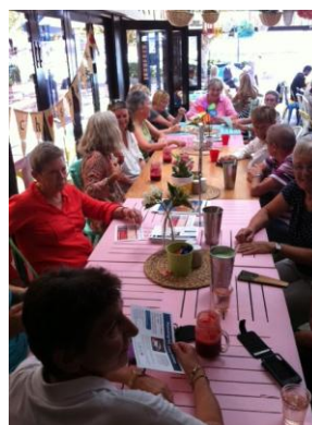
Lesbians Who Lunch meet monthly in cafes around Perth