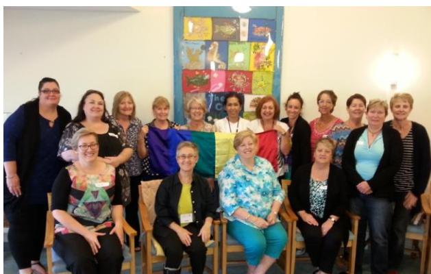
RTB participants, Brightwater, The Cove, Mandurah 28/11/14