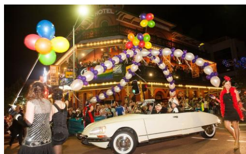
GRAI Pride float, Pride Parade, 15/11/14