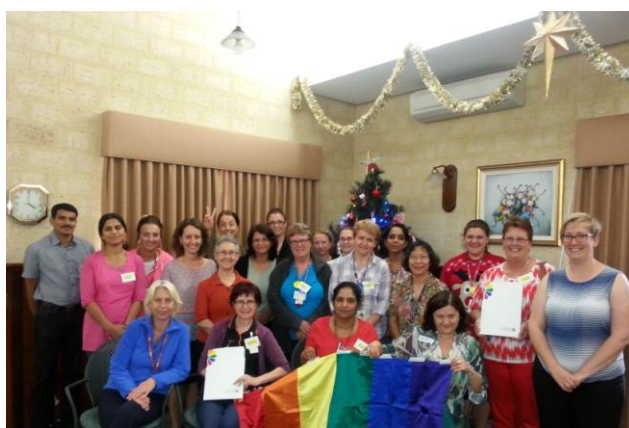
RTB participants, Brightwater, Birralee, Innaloo 5/12/14