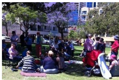
GRAI Community Breakfast, Russell Square, 15/11/14