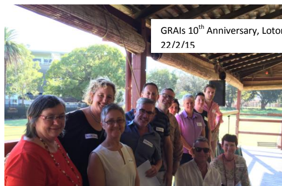
GRAIs 10 th Anniversary, Loton Park 22/2/15