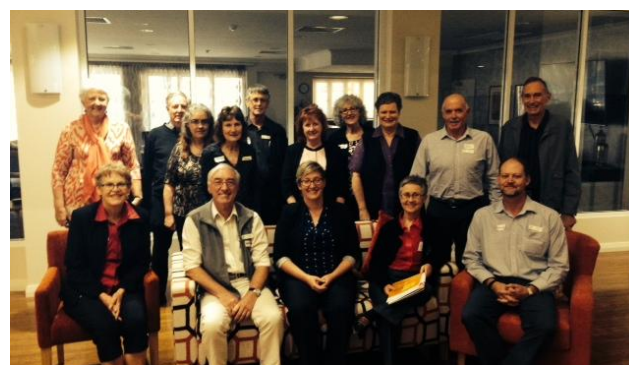
RTB participants, Chaplains course, Bethanie, 13/10/14