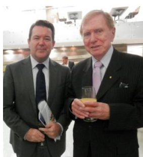
Senator Dean Smith and The Hon Michael Kirby, UWA, 26/3/15