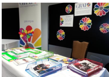
Promoting GRAI with colour: info stall at DBMAS Symposium, 18/6/15