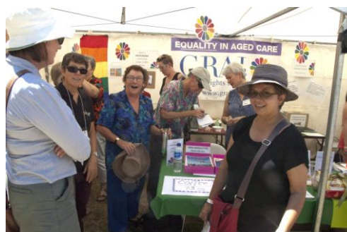
GRAI stall at Fairday, Hyde Park, 15/2/15

Thanks to all Board members for their stalwart support in organising GRAIs social events. The results have been so successful, and great fun!