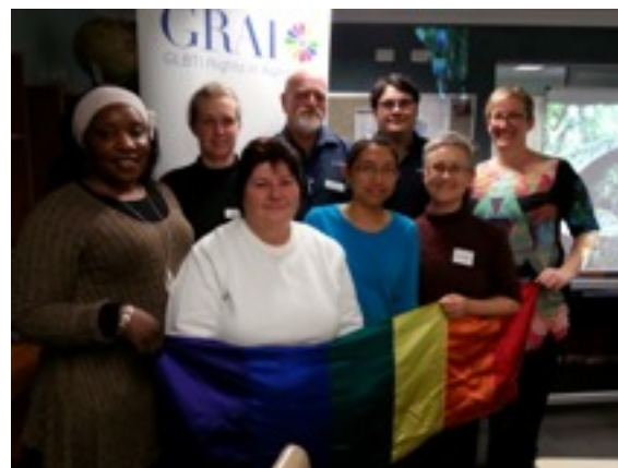
Course participants, Dyrandra Aged Care, Kellerberrin