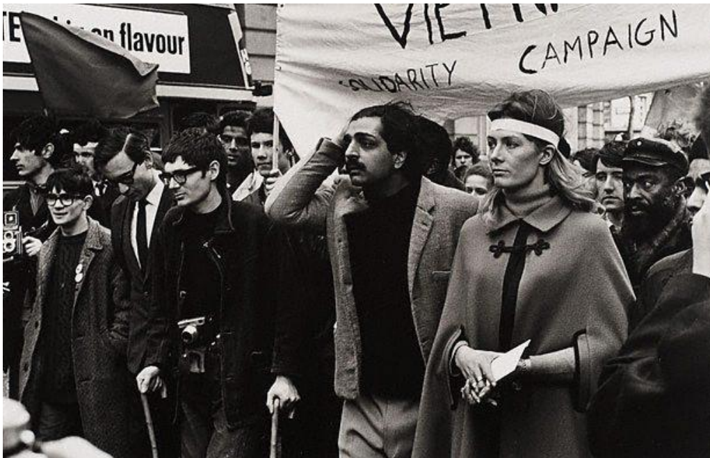
1968: London, Anti Vietnam War Protest.

You know, Middle America is so homophobic. When the AIDS epidemic broke out - I was in New York and there was a guy preaching, saying it was God's way of destroying homosexuals. I helped set up the AIDS training clinic at St Mary's hospital in London, we wanted to dispel the myths surrounding AIDS. It was really difficult telling mothers and fathers that their son was going to die and there was no cure. In those days the drugs weren't working.