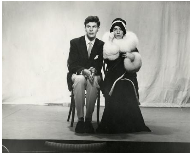
1957: Melbourne. Review. Further off the Reach. Noel starring with Mary Hardy.